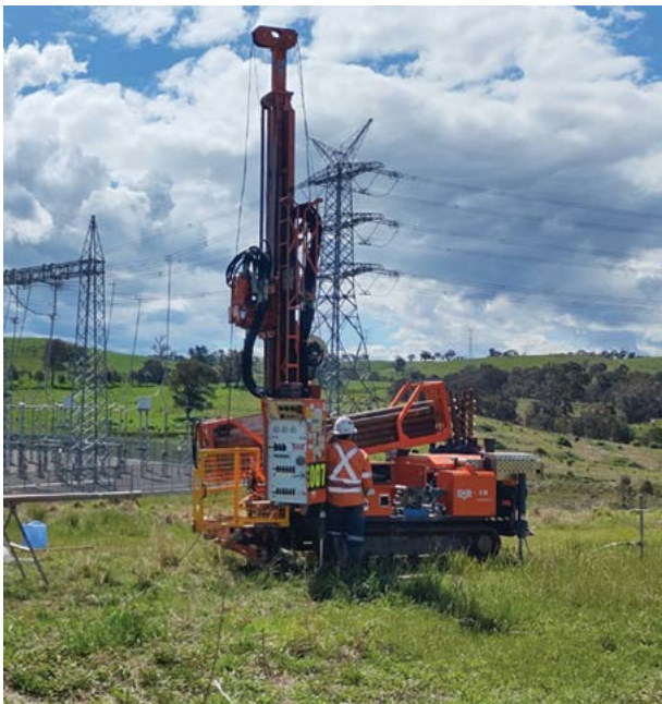
Pictured: Geotechnical investigations at Bannaby substation.

In December, the HumeLink Community Consultative Group (CCG) meetings were held in Snowy Valley and Upper Lachlan on the 14 December. CCG meeting minutes are uploaded onto the HumeLink website . The next CCG meetings will take place in February 2023. Please see our CCG schedule in this edition.