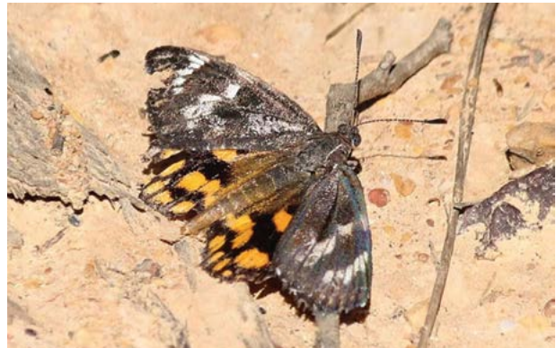
Pictured: The Golden Sun Moth.

During November and December 2022, ecologists completed field work looking for Golden Sun Moth habitat. The assessment findings will be documented in a Biodiversity Development Assessment Report (BDAR) which forms part of the EIS. This report will outline the potential impacts and proposed mitigations.