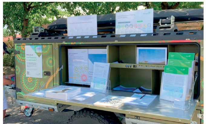
Pictured: HumeLink Community Information Sessions

As the project progresses will continue to host sessions online and in-person.