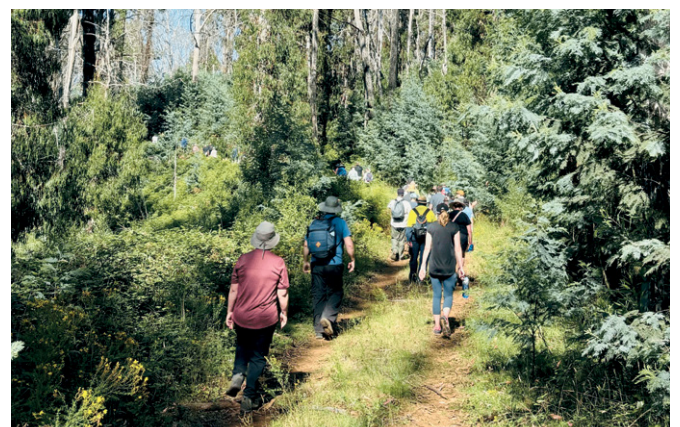
Pictured: Tumbatrek community and government leaders hiking through Bago State Forest.

Tumbatrek brings together approximately 150 community members, local MPs, businesses, and organisations actively contributing to the region. Their collective presence fosters collaboration, dialogue, and a shared commitment to the growth and wellbeing of Snowy Valleys communities.