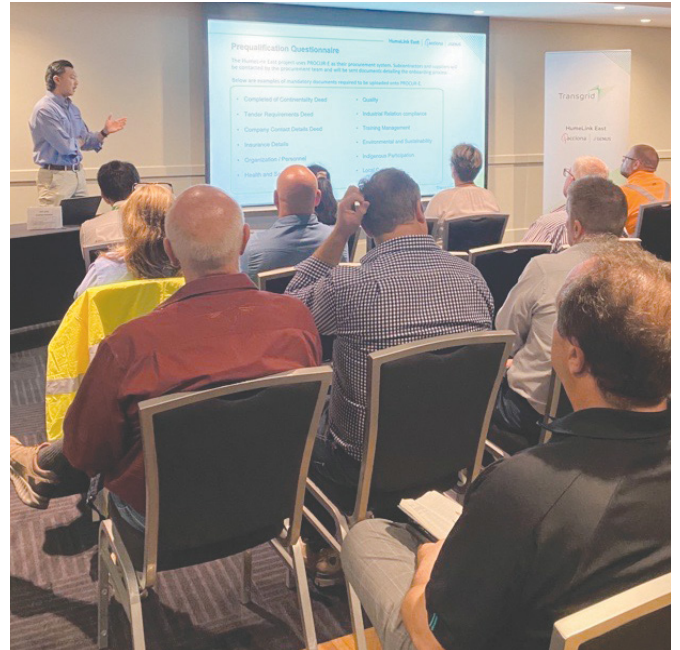
Pictured: HumeLink East Business Buzz Sessions