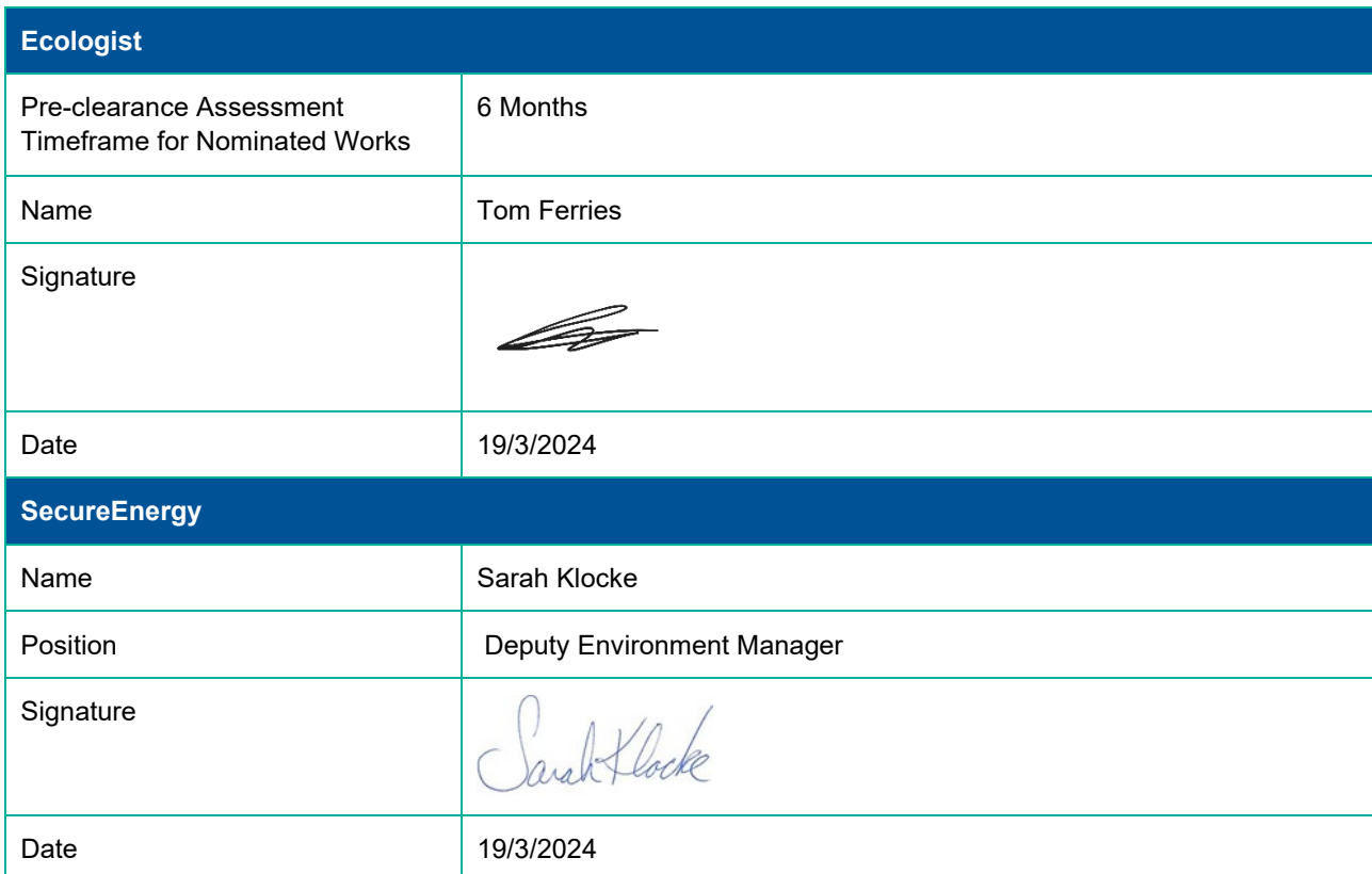
Table 3 – Pre-Clearance Approval

Once printed this document becomes uncontrolled. Refer to Secure Energy Intranet for controlled copy