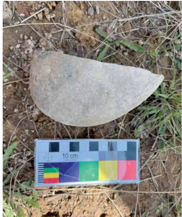
Right: Hammerstone artefact found near Taralga.

Transgrid will continue to assess and identify potential impacts to Aboriginal heritage over the coming months and consider opportunities to avoid or minimise impacts. Survey findings will be included in a revised Aboriginal and Cultural Heritage Assessment Report (ACHAR) presented in the Amendment Report.