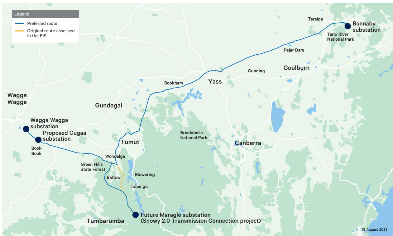
Figure 1: HumeLink preferred route.