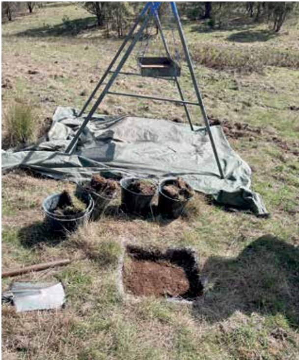
Left: Test excavation at a Potential Archaeological Deposit site.

Transgrid's heritage consultants will report the findings onto the NSW Aboriginal Heritage Information Management System (AHIMS). This database contains information for over 100,000 recorded Aboriginal sites and over 14,000 archaeological and cultural heritage assessment reports across NSW.