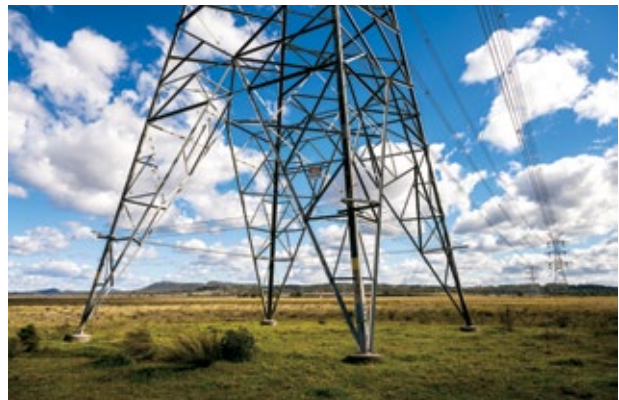
Figure 6 – 500 kV transmission tower legs and concrete foundations.

Further details about easements can be found in the Transgrid Easement Guidelines , on the Transgrid website.