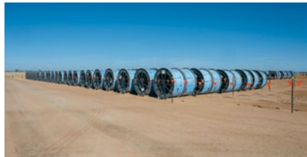
Figure 5 – Conductors stored onsite before being winched into position.