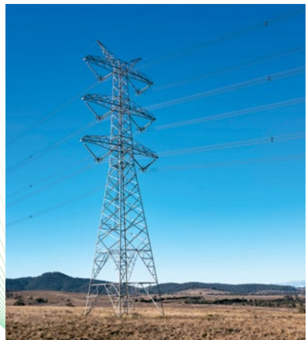
Figure 1 – Example of a 500 kV transmission tower.

Each cross arm of the tower will support three bundles of conductors (also known as cables or wires). The design of the towers will vary depending on the terrain but will typically range from 50–76 metres (maximum) in height. Distance (or span) between the towers will be approximately 300 to 600 metres, dependent on topography and ground conditions.