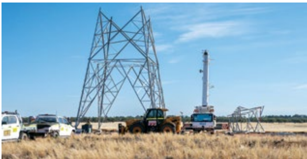
Figure 4 – A 500 kV transmission tower being assembled onsite.

Preparation, assembly, erection, stringing and restoration will be done in parts. Each part may take up to a week to build, dependent on the topography and tower type.