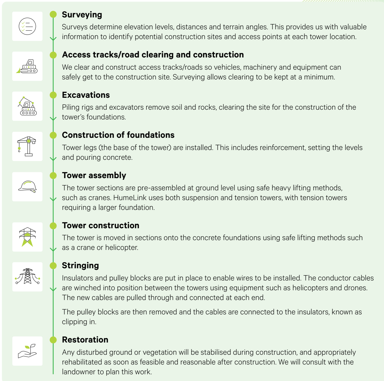
Figure 3 – Transmission line construction process.

Preparation, assembly, erection, stringing and restoration will be done in parts. Each part may take up to a week to build, dependent on the topography and tower type.