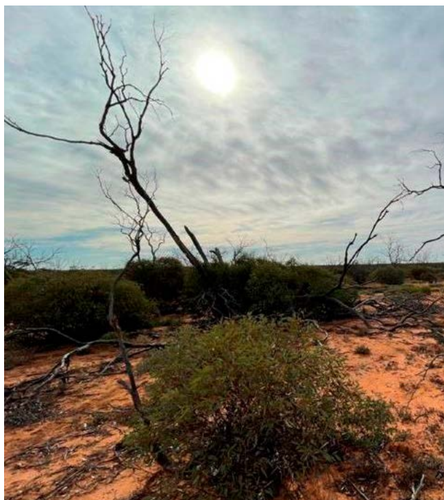
Showing a sparse canopy due to historical clearing

Land eligibility can be affected by Property Vegetation Plans (PVPs), previous reservations (e.g. established under the Land Management (Native Vegetation) Code 2018 or other act, regulation or code), mining interests or other restrictive covenants on title.