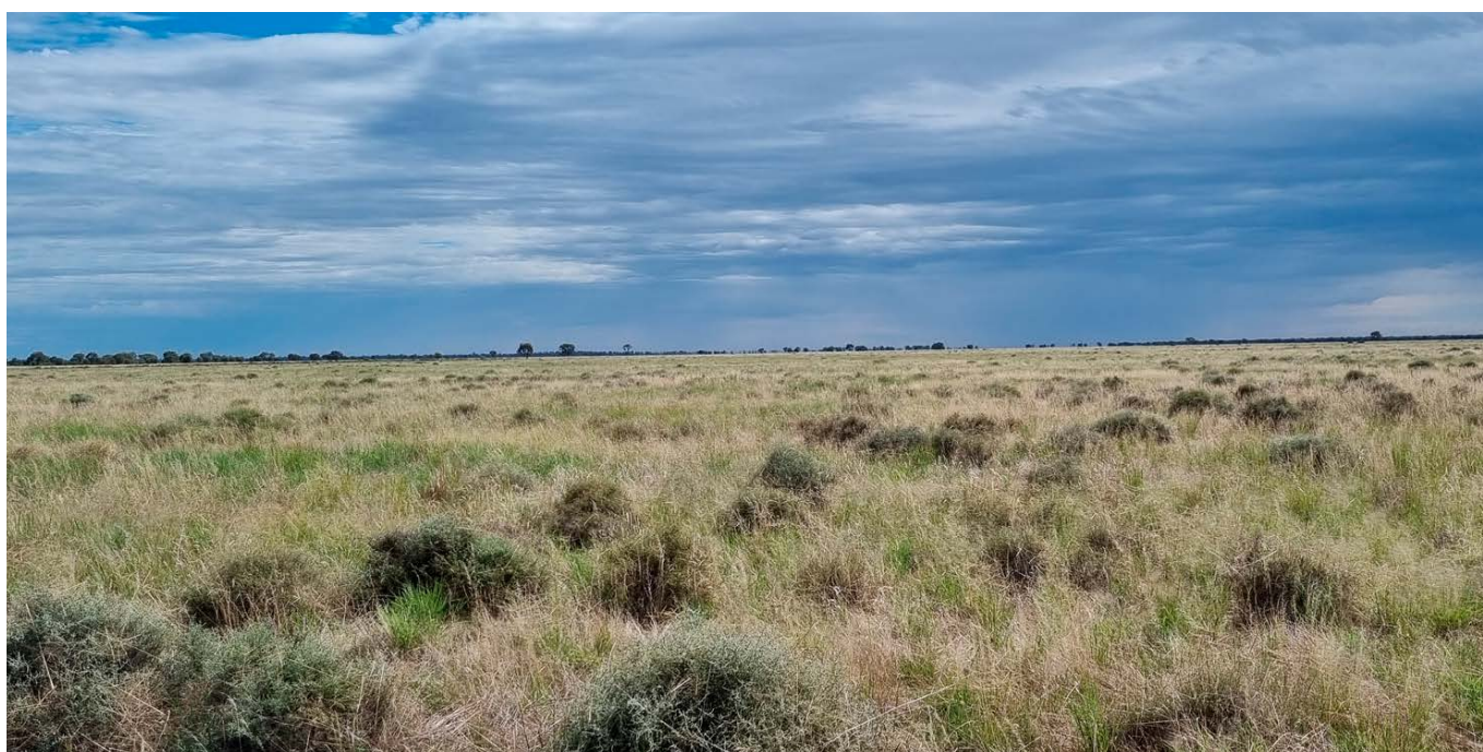
Cotton bush, project EnergyConnect

The credits generated by the BSA are then purchased by organisations like Transgrid who are carrying out projects which have an impact on biodiversity that and needs to be offset.?