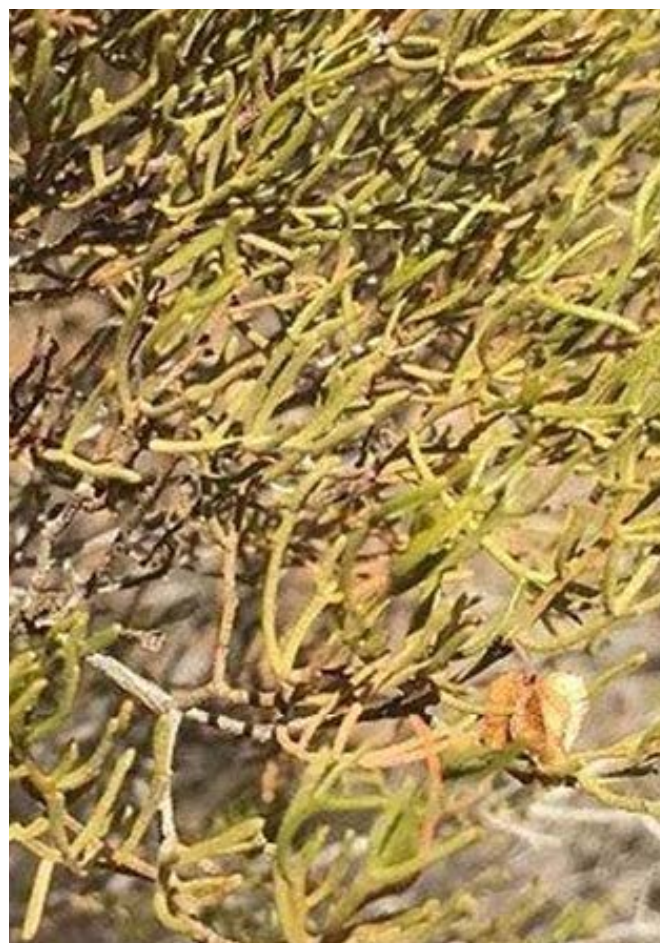
Dodonaea stenozyga (Desert Hopbush) recorded within the site

In the case where you sell insufficient credits to fulfil the total cost of management actions, as determined in a Total Fund Deposit, then the land within the BSA is still subject to the agreement in perpetuity. Cancelling or varying a BSA after credits have been sold will only be considered in exceptional circumstances.