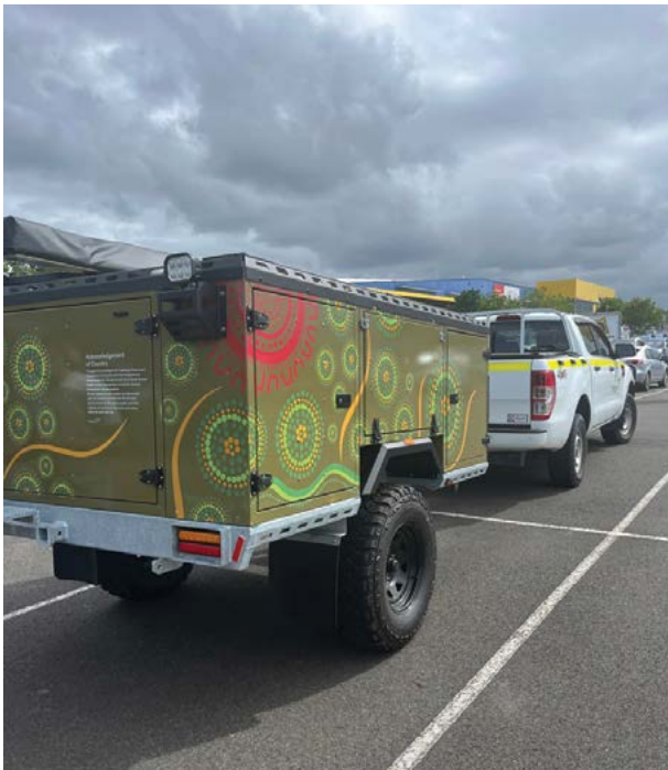
Pictured: RACH ready to hit the road.

For a list of locations and times for RACH please refer to the HumeLink website.