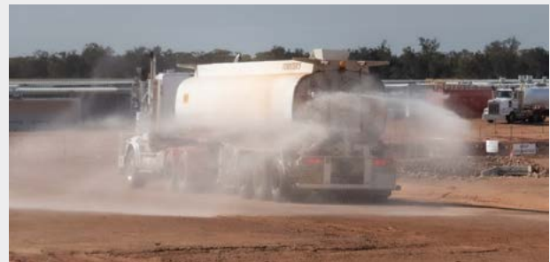
Pictured: Watercart at Transgrid's EnergyConnect Buronga construction site minimising dust.

To learn more about the HumeLink EIS, please visit the EIS Frequently Asked Questions on our website: transgrid.com.au/projects-innovation/humelink#Regulatory-and-Environmental-Approvals .