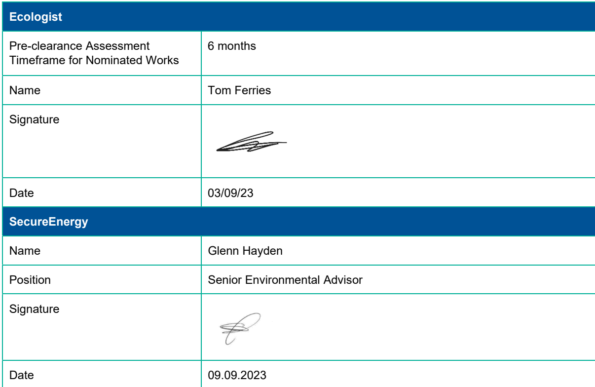
Table 3 – Pre-Clearance Approval