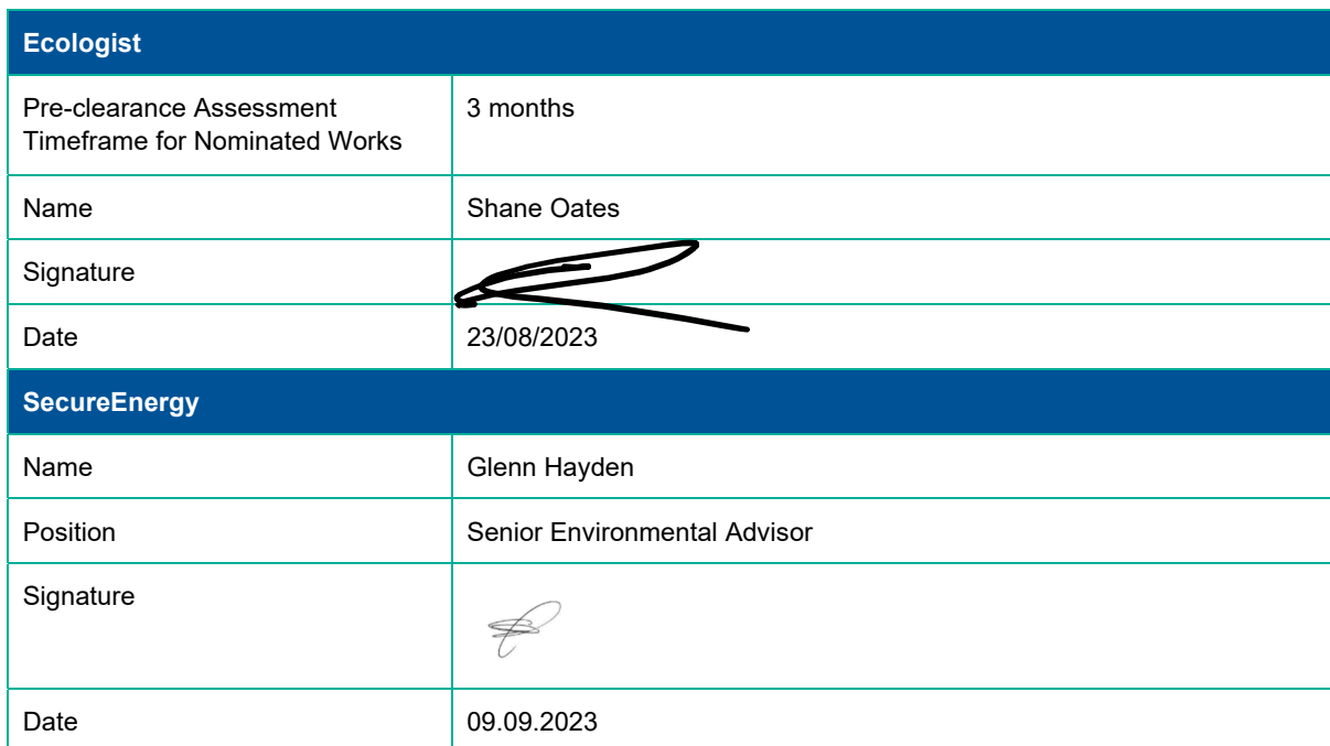
Table 3 – Pre-Clearance Approval