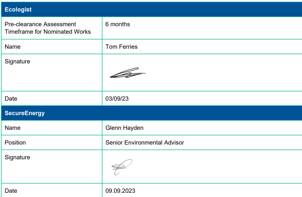
Table 3 – Pre-Clearance Approval