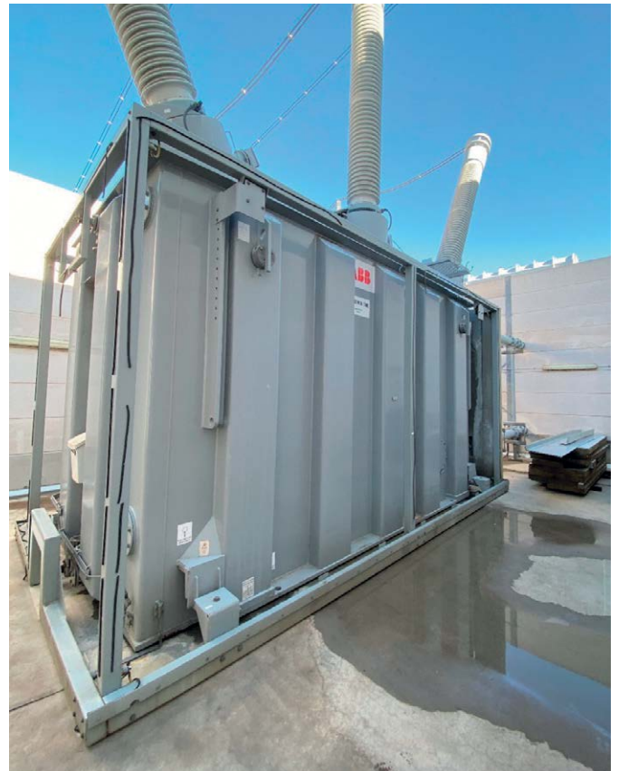
Image: A three phase 500kV shunt reactor.