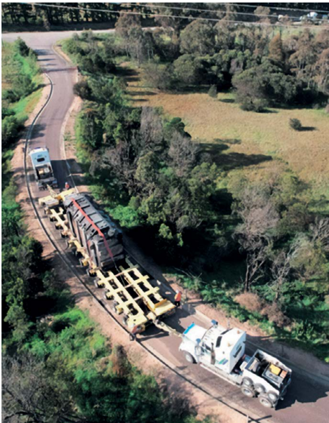
Image: A transformer being transported.

Auxiliary services buildings for HumeLink would include secondary systems such as control, automation, protection and communication systems and ancillary services such as fire detection, security system and air conditioning.