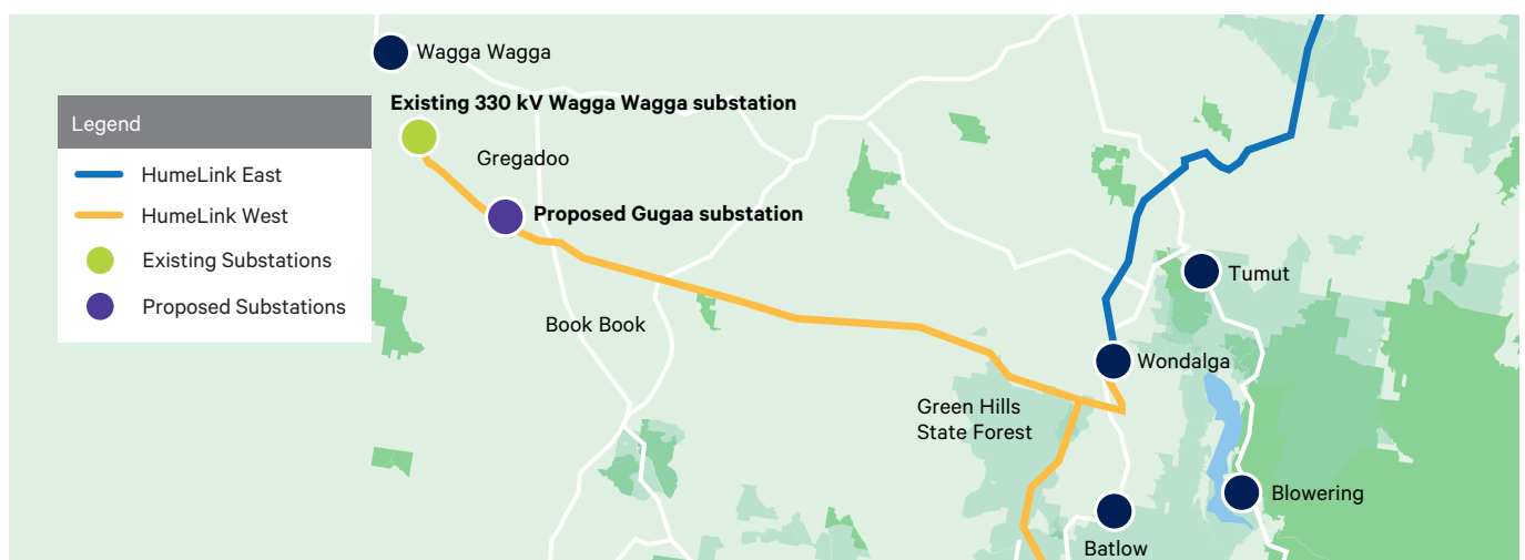
Image: Wagga 330 kV substation and proposed Gugaa 500 kV substation

The project would connect to the future Maragle 500 kV substation approved under the Snowy 2.0 Transmission Connection Project .