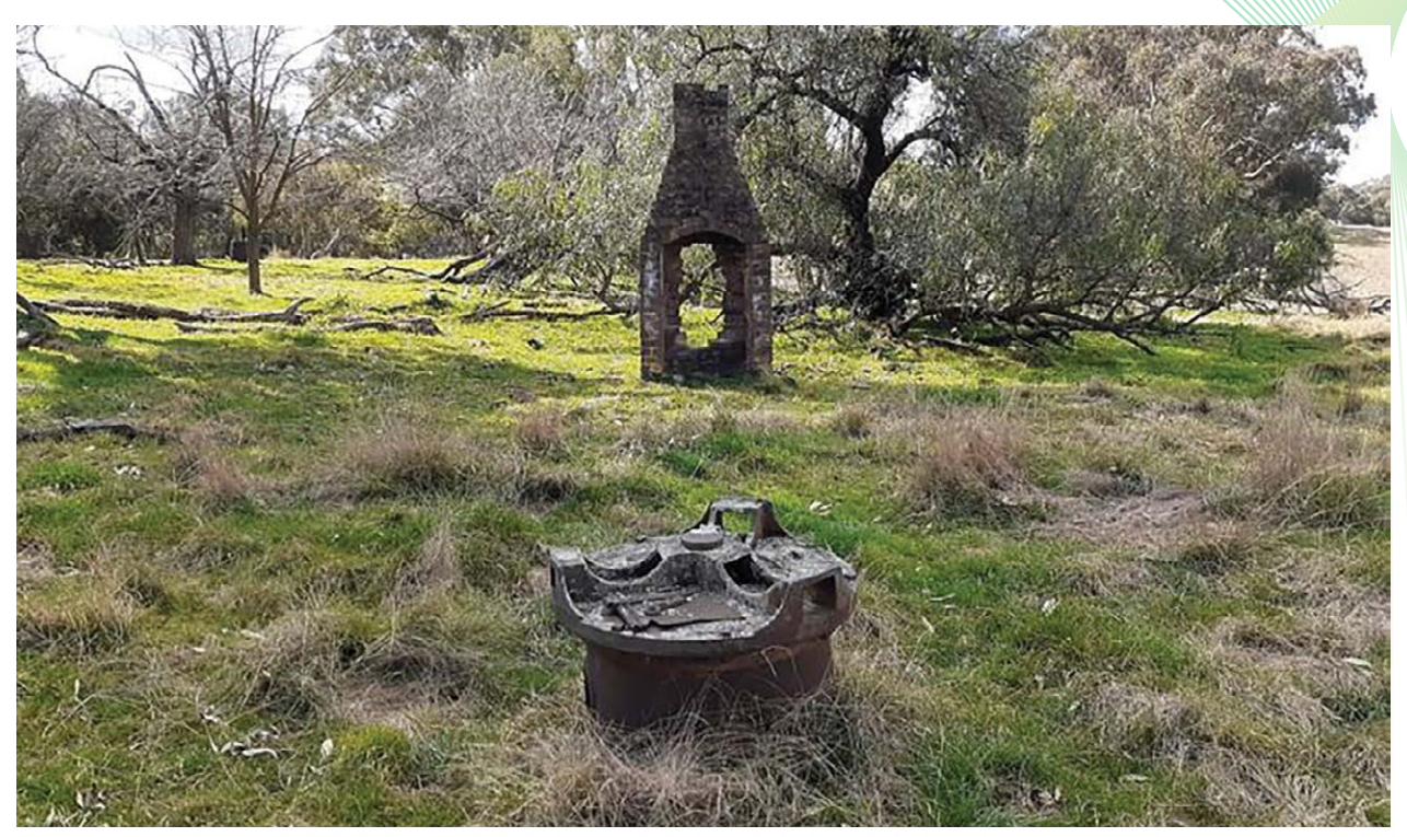
Pictured: Iron pit and fireplace in Bango identified during field survey.