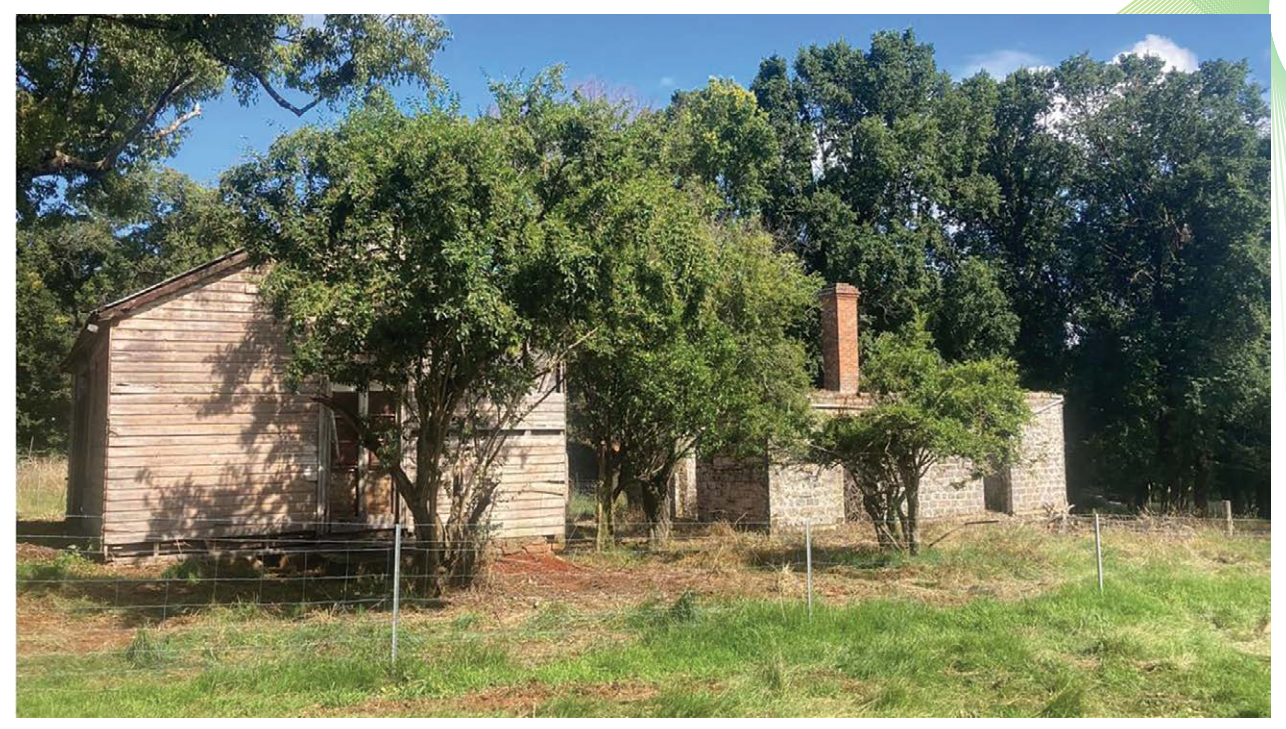
Pictured: Kiley's Run located two kilometres west of Adjungbilly, at least 200 metres west of the project footprint.