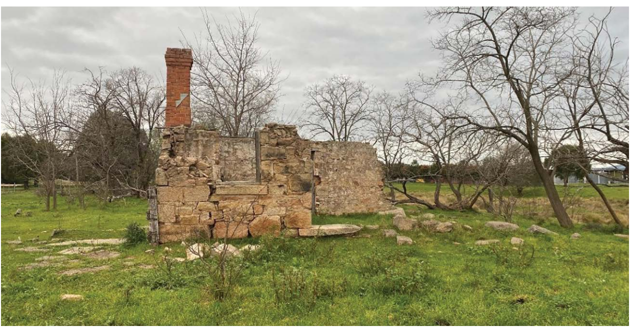
Pictured: Stone ruin looking west from Gregadoo East Road, approximately 500 metres east of the project footprint.