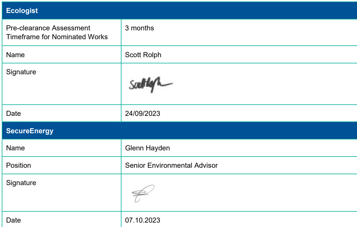
Table 3 – Pre-Clearance Approval

Once printed this document becomes uncontrolled. Refer to Secure Energy Intranet for controlled copy