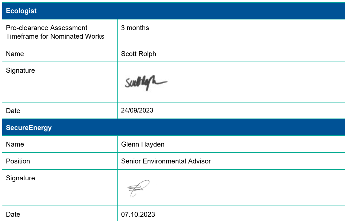
Table 3 – Pre-Clearance Approval

Once printed this document becomes uncontrolled. Refer to Secure Energy Intranet for controlled copy