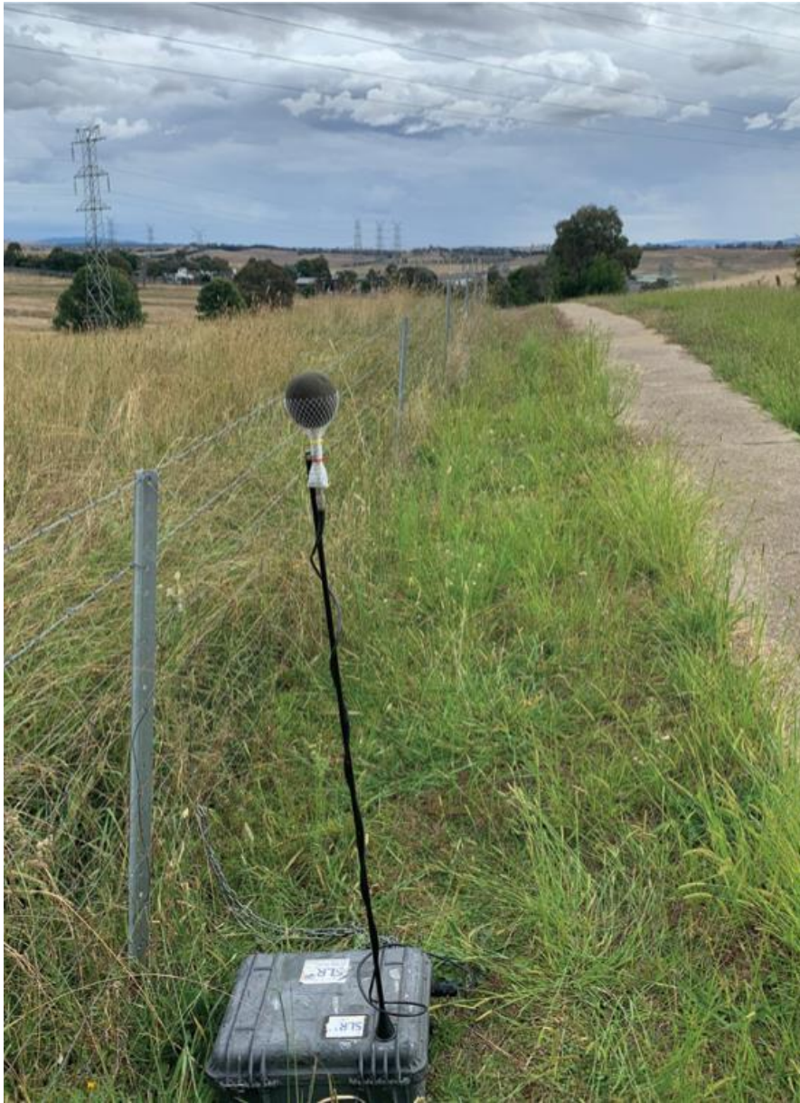
Noise logger measuring background noise