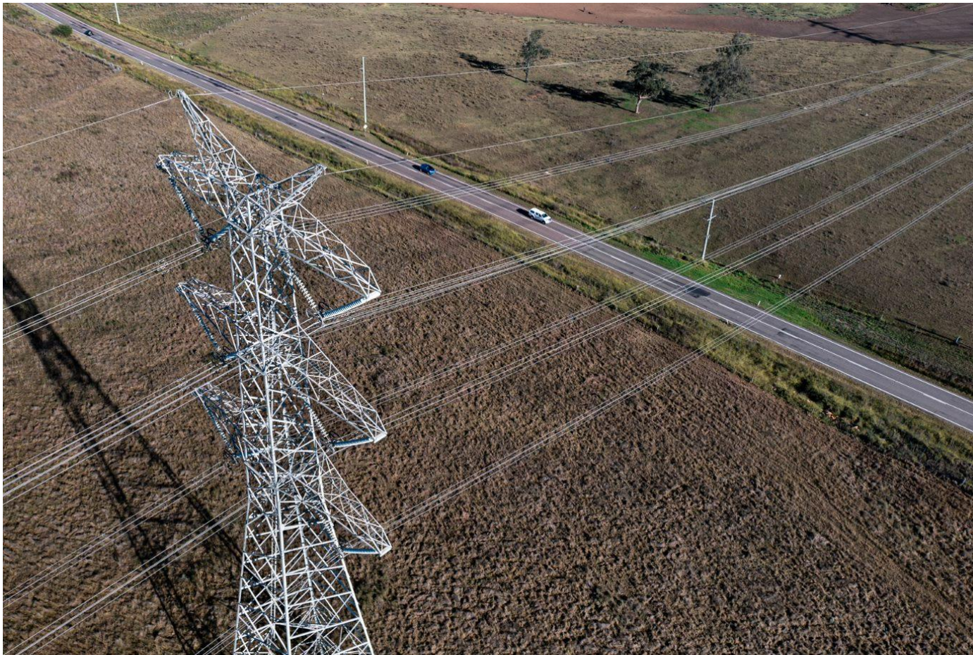
Line stringing over a local road