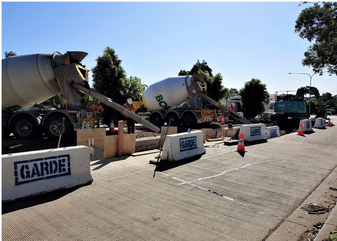
Work site at Muir Road, Chullora