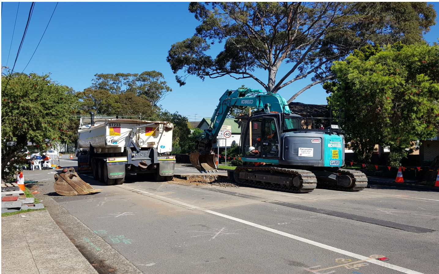
Joint bay construction in Yangoora Road, Lakemba