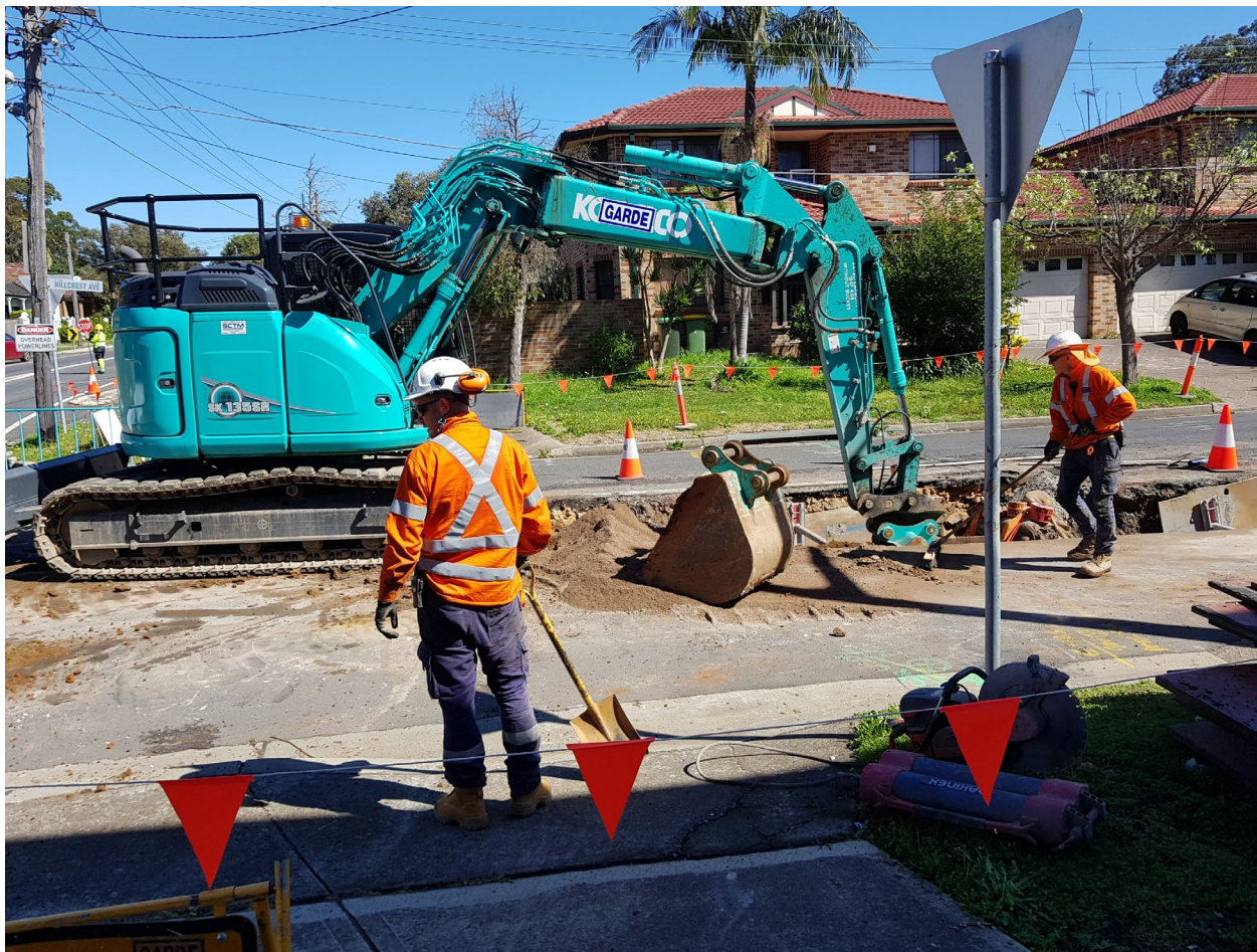
Work crews at Hillcrest Avenue, Greenacre