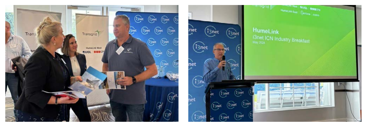
Pictured: HumeLink i3net and ICN Industry Breakfast.

To view the presentation from the event, visit the HumeLink website: i3net and ICN Industry Breakfast Presentation May 2024.