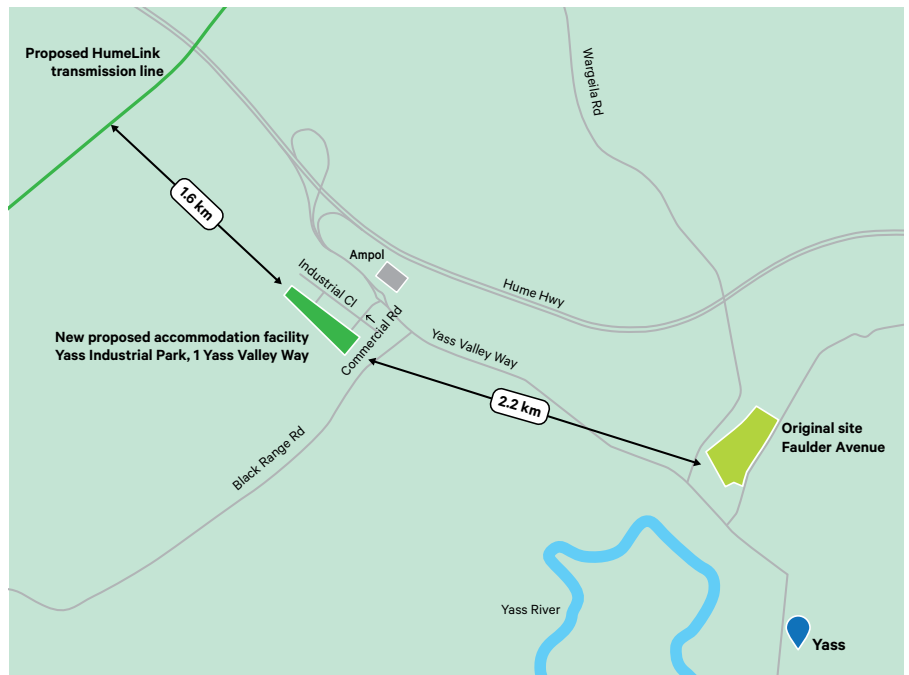
Figure: Location of original vs new proposed accommodation facility at Yass Industrial Park.

Five temporary accommodation facilities were proposed in HumeLink's Amendment Report that was lodged to the DPHI in May