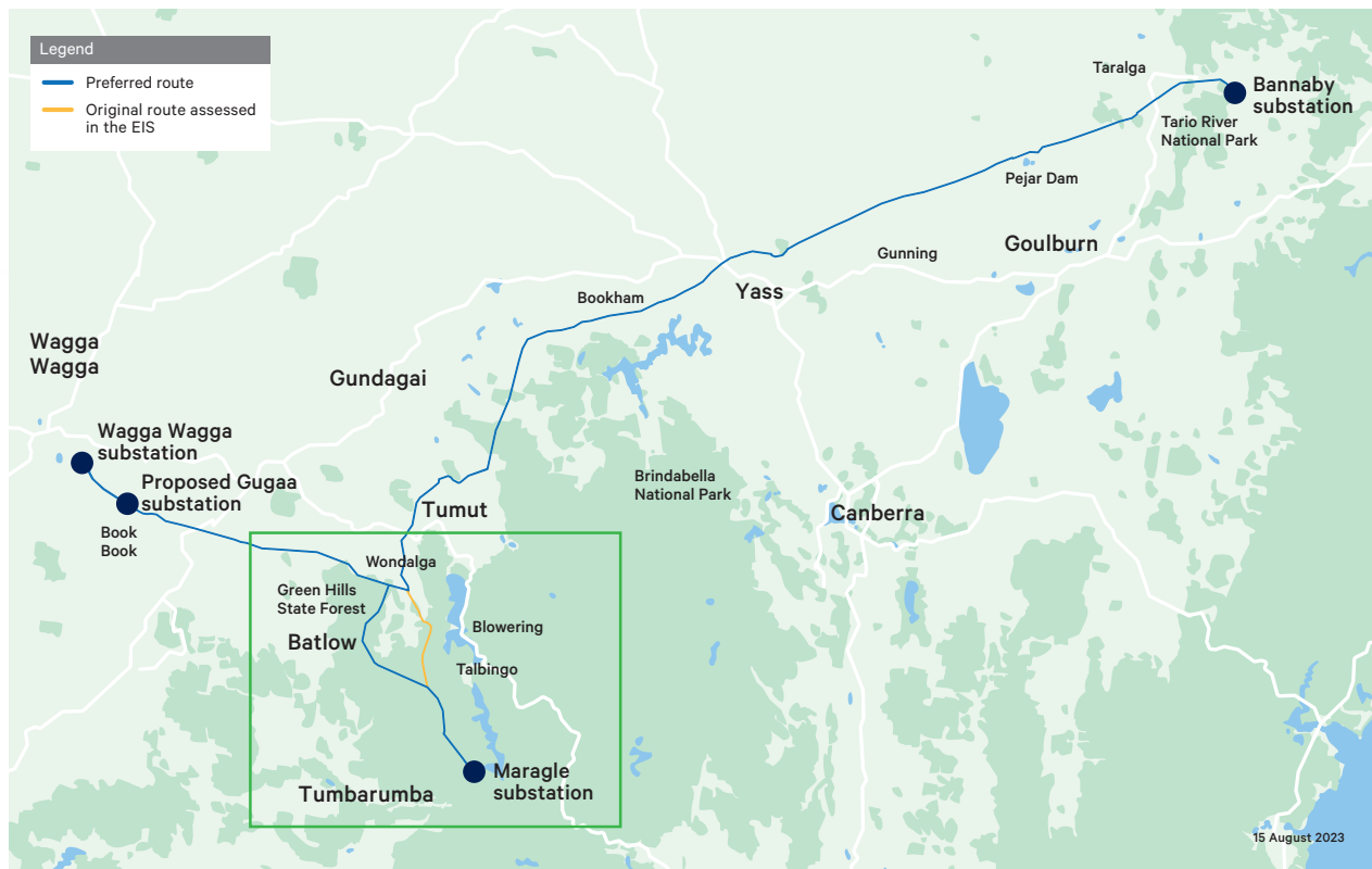
Figure 2: HumeLink preferred route.

View the preferred corridor and provide feedback via our Interactive Map .