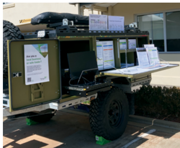
Image: Remote Access Community Hub (RACH) setup in the project area during the EIS exhibition.

If you are unable to join us in-person or online, we have developed a digital EIS which is a user-friendly and interactive platform to present the key outcomes of the EIS. You can view the digital EIS on the HumeLink website .