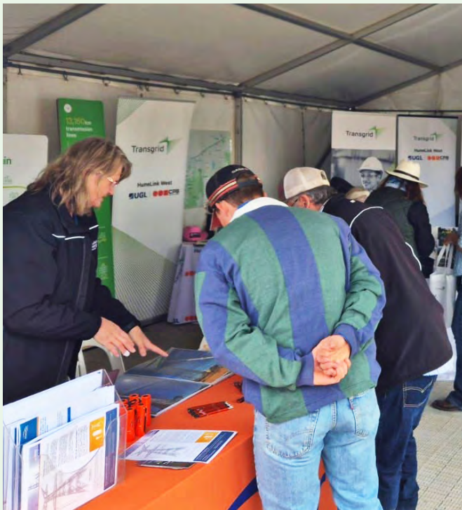
Images: The team at Henty Machinery Field Days 2024.

Our teams appreciated the opportunity to chat with more than 200 community members over the three days. Thank you to everyone who came to say hello!