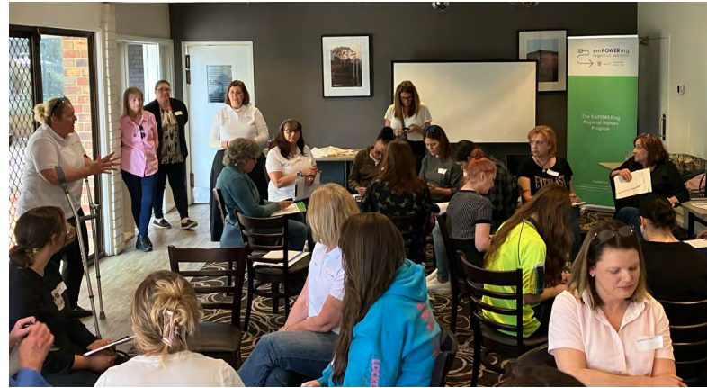
Image: The EmPOWERing Regional Women Program information session in Yass.

The program is a great step towards diversifying the workforce and creating opportunities for regional women. It has been made possible through a grant from the NSW Government, Women in Construction Industry Innovation Program.