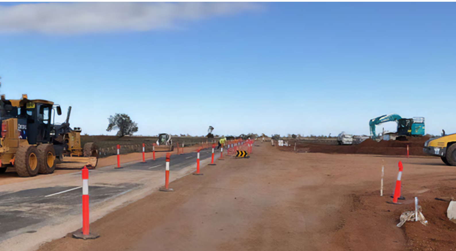
Example of access point works on Transgrid's EnergyConnect project.

An Enabling Works Management Plan (EWMP) has been developed to describe how these works will be managed, and this was submitted to the DPHI as part of the planning approval process.