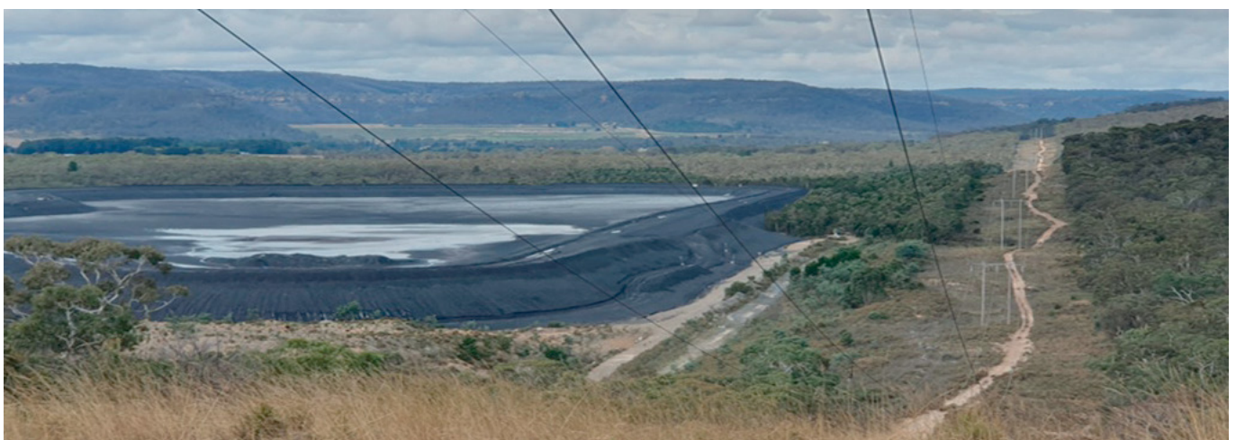
Image: Photo of current 45m easement for 132 kV transmission line. Under the preferred route option, Transgrid is proposing to increase the width of the easement by approximately 15 m to the north (left hand side) to accommodate the new 330 kV transmission line. The 330 kV line would replace the 132 kV line shown above.

The Wallerawang and Mount Piper area (shown in the map overleaf) is located approximately 20 kilometres north-west of Lithgow on the western fringes of the Blue Mountains.