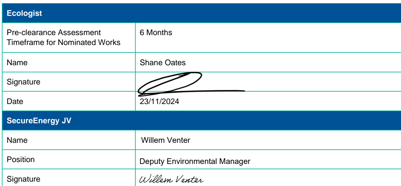
Table 3 – Pre-Clearance Approval

Once printed this document becomes uncontrolled. Refer to Secure Energy Intranet for controlled copy