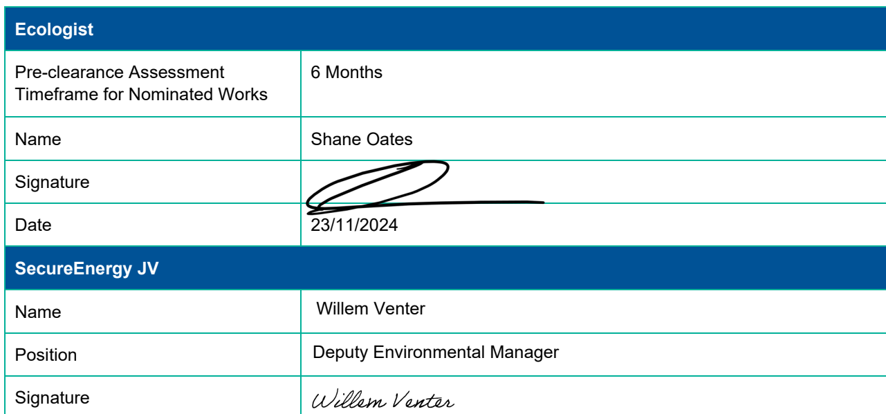
Table 3 – Pre-Clearance Approval

Once printed this document becomes uncontrolled. Refer to Secure Energy Intranet for controlled copy