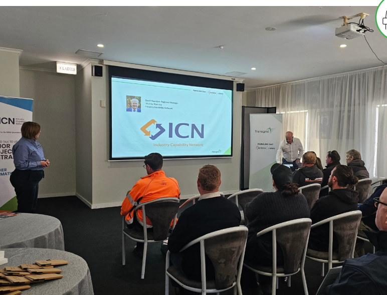
Image: HumeLink East's May Business Buzz session in Yass.