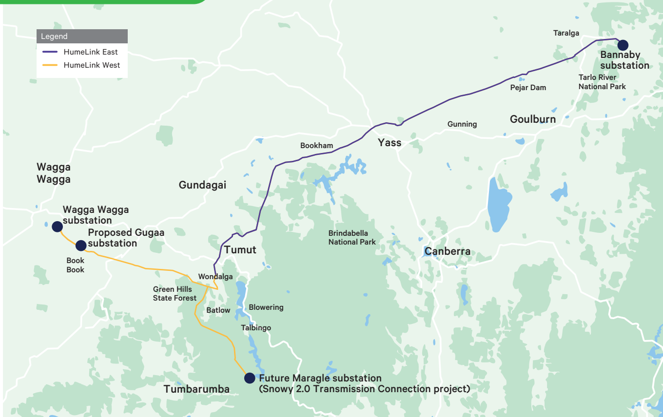
Figure 1: HumeLink preferred route.