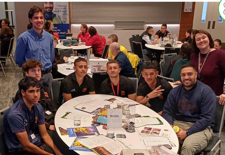
Image: HumeLink West and Clontarf academy students at the Riverina Employment Forum.