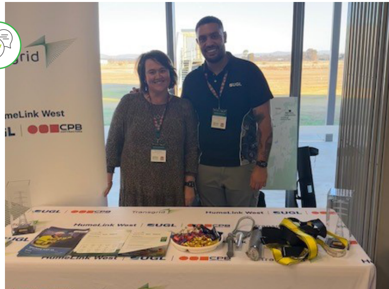
Image: HumeLink West team at a recent industry event.

If you're unable to join an in-person event but are interested in the HumeLink West work packages, you can submit an Expression of Interest on the ICN website .