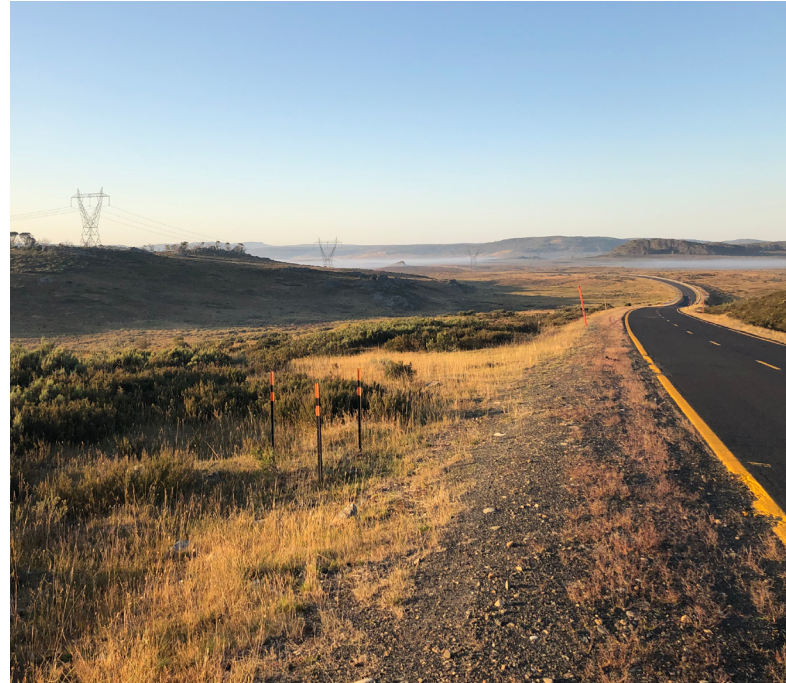
Image: Snowy Mountains Highway.

The amended project also prioritises the use and upgrade of existing access tracks over the creation of new access tracks, where possible.