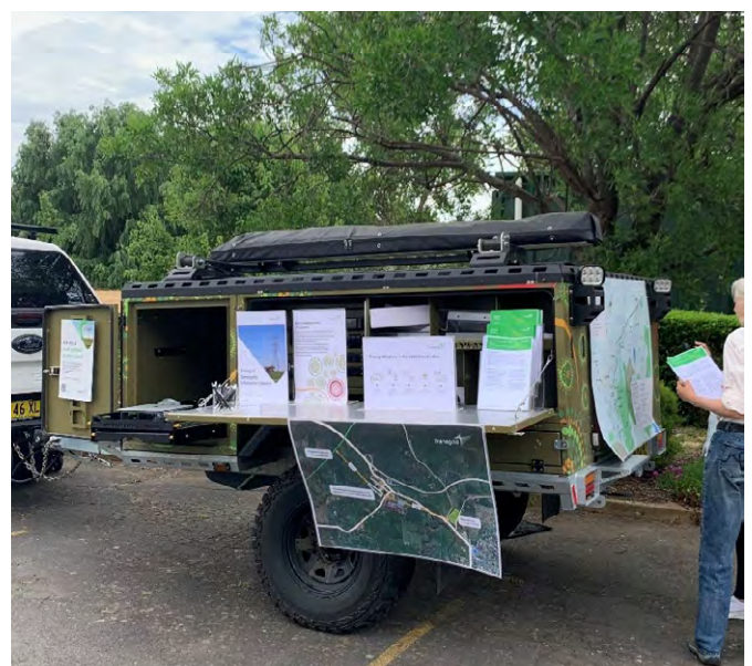
Image: Pop-up information session with RACH at the Yass Valley Men's Shed.

Thank you again to everyone who joined us!