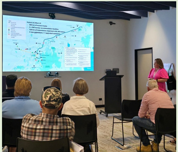
Image: HumeLink West team presenting at the Riverina Major Projects Information Session at the Transgrid Wagga Wagga Discovery Hub.

The team had invaluable conversations with various sole traders and businesses. Thank you to everyone who joined us. To find out more about our upcoming industry information sessions, visit the HumeLink East and the HumeLink West web pages.