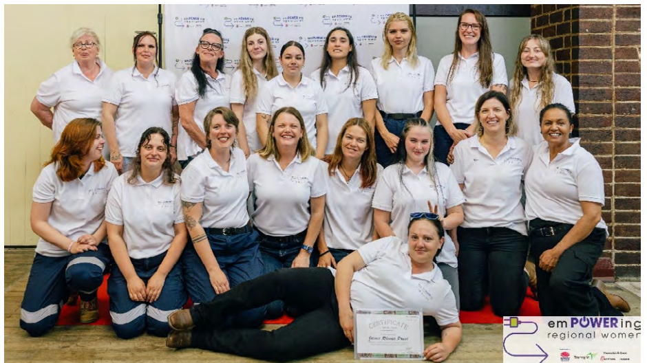
Image: Graduates of the EmPOWERing Regional Women Program, November 2024.