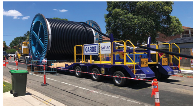
Delivering and pulling cable into the conduits at Maiden Street, Greenacre

We are committed to working with you to minimise impacts of the project. Feedback we have received so far has helped us improve the way we work in the community. We would like to thank everyone who has been in touch with us so far.