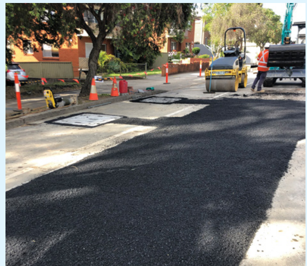
Temporary road restoration, Yangoora Road, Lakemba