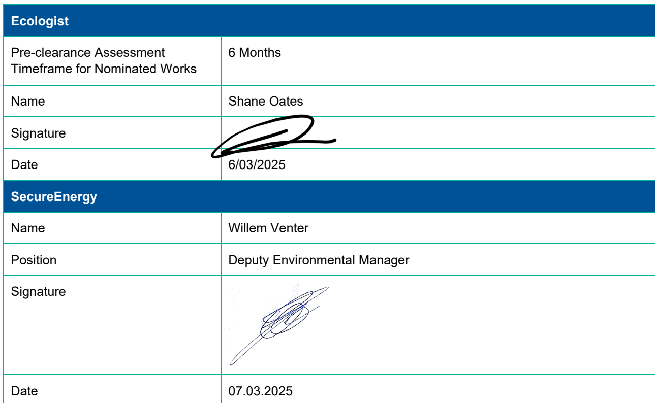
Table 3 – Pre-Clearance Approval

Once printed this document becomes uncontrolled. Refer to Secure Energy Intranet for controlled copy