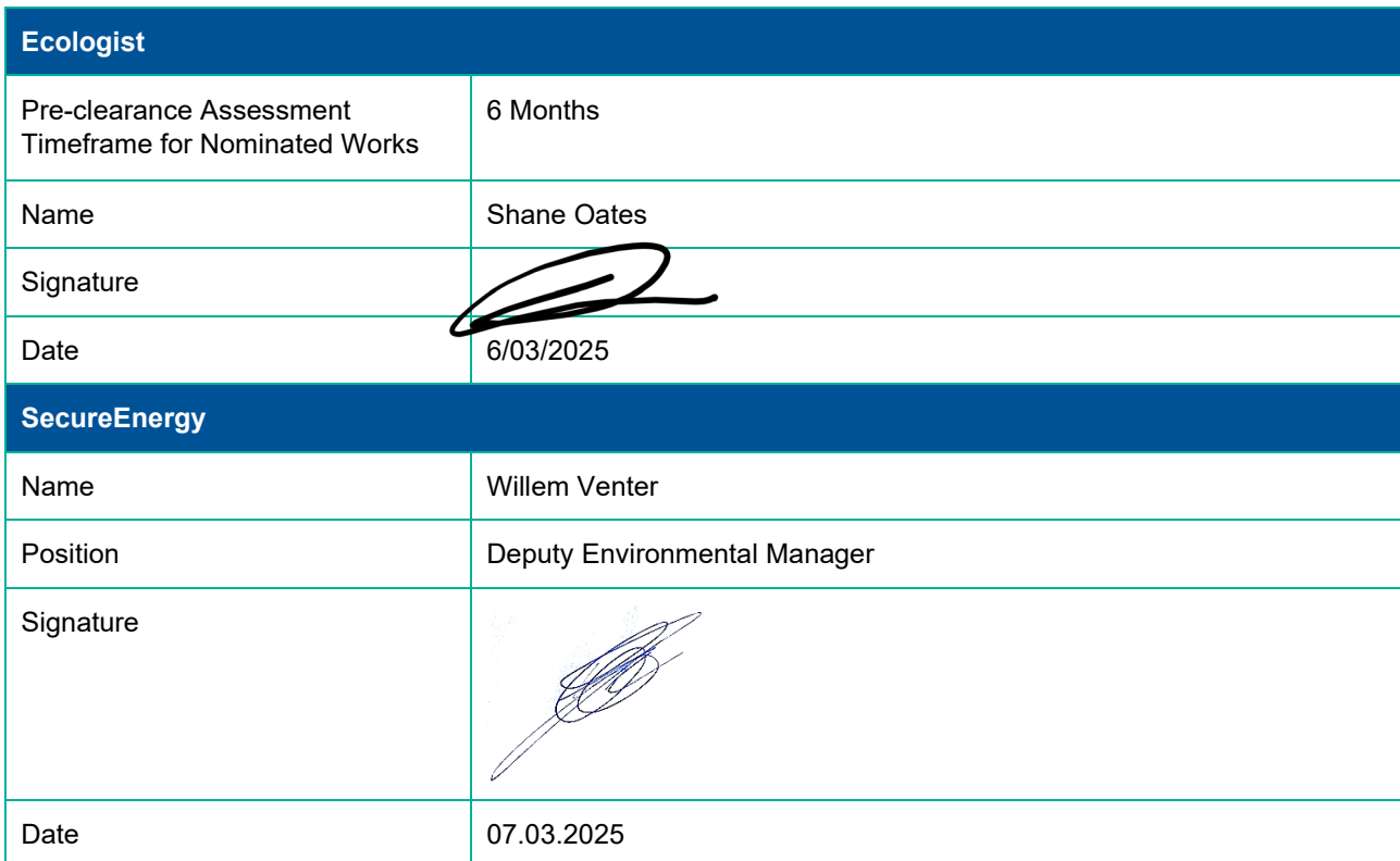
Table 3 – Pre-Clearance Approval

Once printed this document becomes uncontrolled. Refer to Secure Energy Intranet for controlled copy