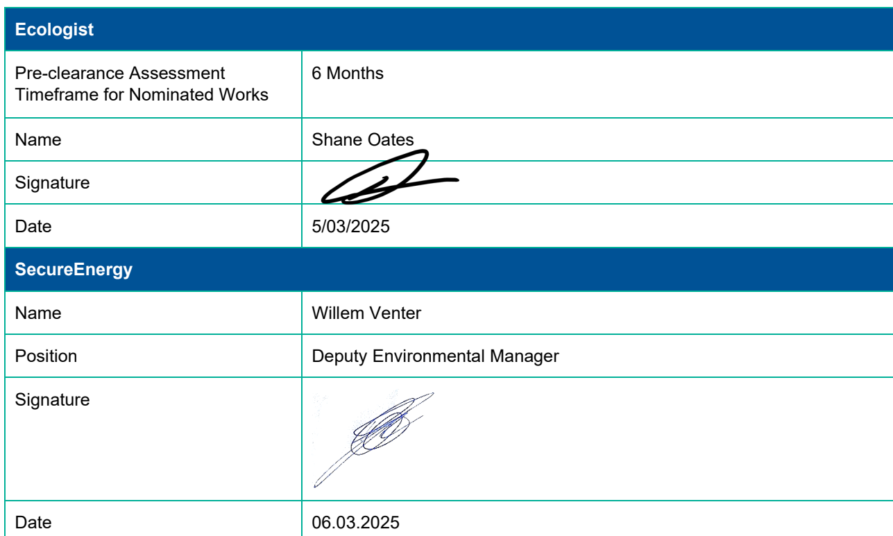
Table 3 – Pre-Clearance Approval

Once printed this document becomes uncontrolled. Refer to Secure Energy Intranet for controlled copy