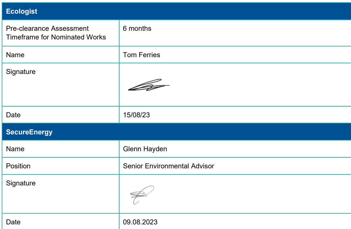
Table 3 – Pre-Clearance Approval