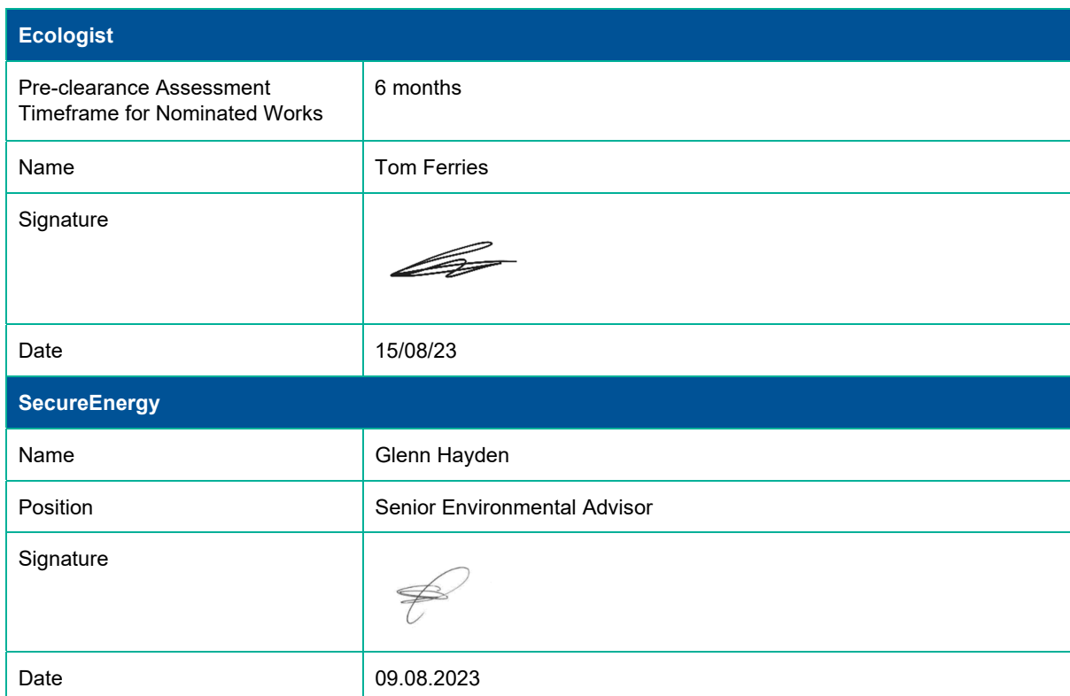
Table 3 – Pre-Clearance Approval

Once printed this document becomes uncontrolled. Refer to Secure Energy Intranet for controlled copy