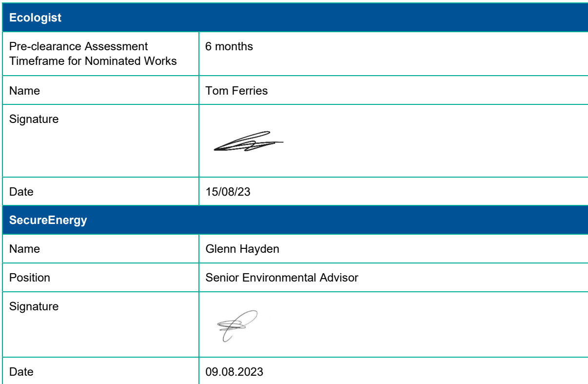
Table 3 – Pre-Clearance Approval